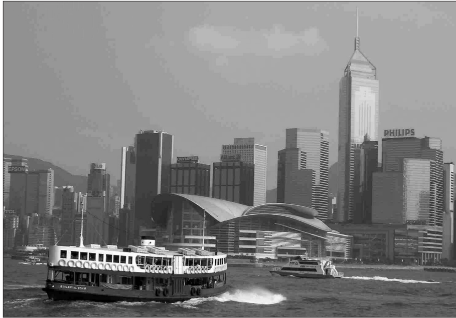
Hong Kong harbor, 2004. "[The] historical projection of Hong Kong as a 'modern' colony and 'global' city explains why the government gives migrants more room for organizing work."

Third, to ensure that local workers would not complain when MDWs began to arrive, the Hong Kong government made the hiring of MDWs appear to be a "privilege," meaning that employers had to be rich enough to provide airfare, private accommodation, minimum wage, and a full day off each week, all conditions spelled out in a standard contract. This regular 24-hour day off is crucial for organizing work, because MDWs can then congregate on Sundays and avail themselves of opportunities to become conscientized and organized. Fourth, both the British colonial government and the post-1997 Chinese government are relatively tolerant of protests. The director of MFMW notes that before the transfer of sovereignty in 1997, the police did not intervene as long as the protest was not against the HK government. Even after 1987 when the two-week rule was imposed, the migrant protests against the Hong Kong government did not trigger much reaction from the police, as long their actions were peaceful. 45