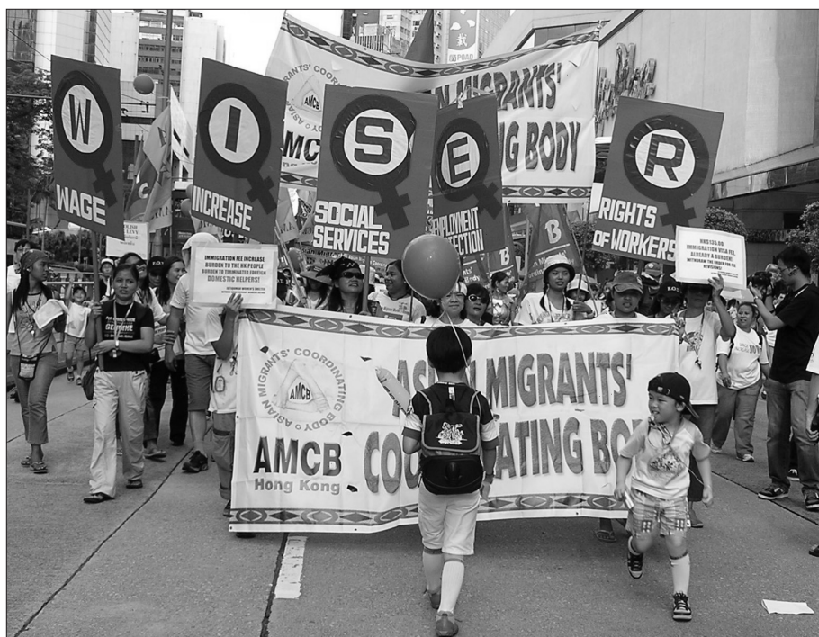
AMCB demonstration, Hong Kong, 2006. "The common basis of unity in the AMCB is the struggle against issues affecting migrants, which is why member organizations identify themselves as part of a migrant movement, rather than simply organizations established for the welfare of their fellow compatriots."

traditional cultural dances and songs in a spirit of international solidarity. 28 Organizations present at the festival were the Thai Women Association (TWA), Feona (Nepal), and Unifil-HK (Philippines). Two months after the cultural festival, the organization representing migrant workers from Sri Lanka, ASL, joined the other groups in organizing the International Human Rights Day celebration on 10 December. (India and Indonesia had no formal groups representing their migrant workers in 1994.)