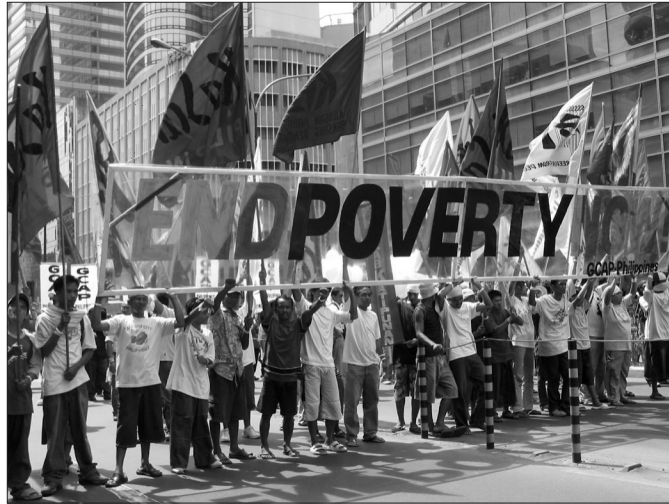
Anti-G8 protest in Makati, Philippines, 2004. Most studies of “globalization from below” typically conclude that transnational activism as such is unplanned, spontaneous, nonorganizational, anarchistic, or postmodern, with the participating networks described as fluid and loose. The daily and regular organizational efforts of grassroots organizations trying to organize across nation-state boundaries have been neglected.

grants from several Asian countries, but also because it is a coalition of grassroots migrant organizations of different nationalities. 17 AMCB’s grassroots transnationalism crosses not only geographical borders but those of nationalities as well.