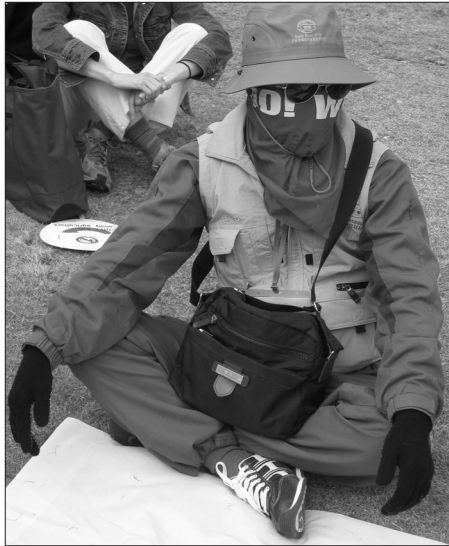
Korean anti-WTO demonstrator, "People's Action Week," Hong Kong, 2005. "The AMCB's knowledge of the WTO was the result of countless educational activities. For more than a year, the AMCB worked with the APMM and other institutions to illustrate the negative impact that the WTO had on migrant workers."

affected the livelihood of people in Indonesia and the Philippines and caused them to have to look for jobs overseas."